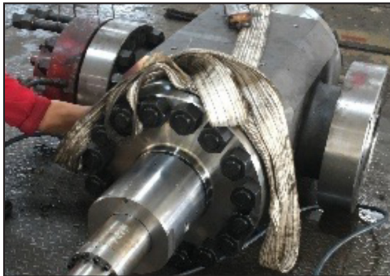
Gate valve before service.

A customer was designing a gate valve for an Oil and Gas application. It would see a temperature range of -40°C (-40°F) to 180°C (356°F) and maximum pressure of 138 MPa (20,000 psi). It would be exposed to crude oil, natural gas, and high concentrations of H 2 S and CO 2 . The customer had tried seals from competitors, but they were failing. Time was running out and they needed a solution.